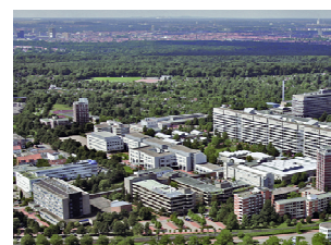
Hannover medical school