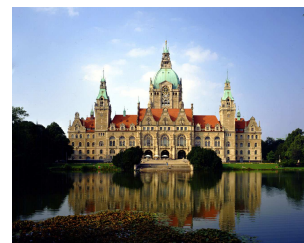
Hannover City Council

For more information, visit the website of the conference.